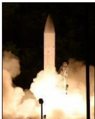
March 19, 2020: Flight Experiment 2