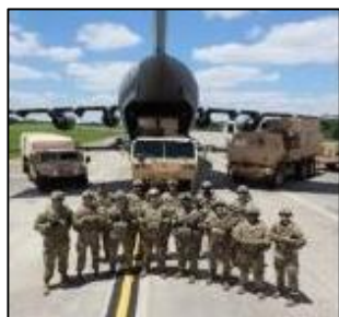
Unit Equipment C17 Configuration Load-out Jun 2021