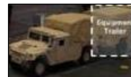
Battery Operations Center